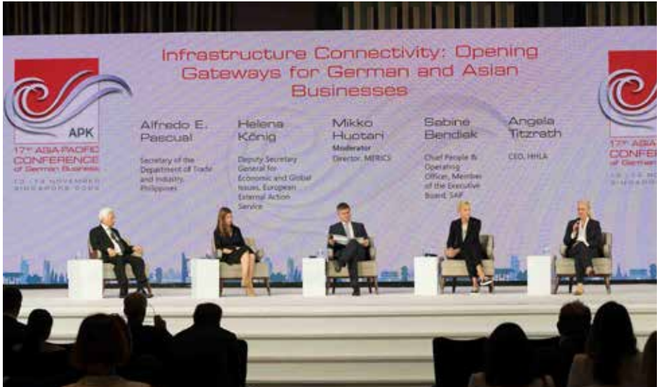
▲ Panel: Infrastructure Connectivity: Opening Gateways for German and Asian Businesses