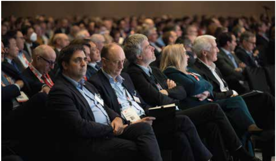
APK 2022 Singapore, Raffles City Convention Centre